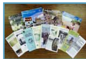
A sample of just some of the brochures that are distributed at shows.