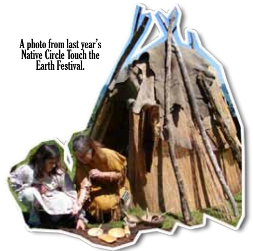
A photo from last year's Native Circle Touch the Earth Festival.

May 28-29: Native Circle Touch the Earth Festival. 12pm to 5pm. Mexico Point Park, 104B.