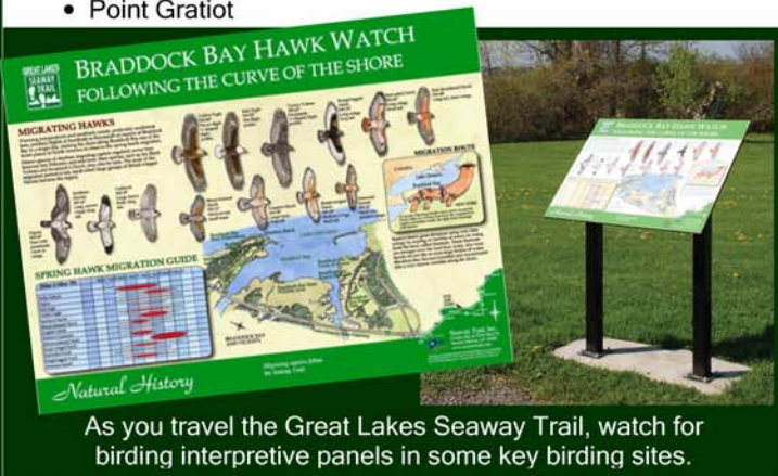
As you travel the Great Lakes Seaway Trail, watch for birding interpretive panels in some key birding sites.

5. Eastern Lake Erie: This region is heavily urbanized, yet excellent birding opportunities are available on preserved lands and redevelopment lands where restoration has occurred.