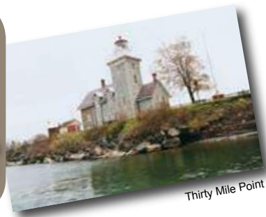
Thirty Mile Point