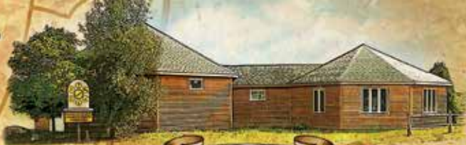
Salmon River International Sportfishing Museum Altmar