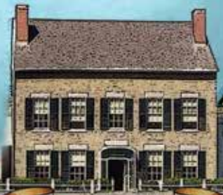
Fort Ontario State Historic Site Oswego