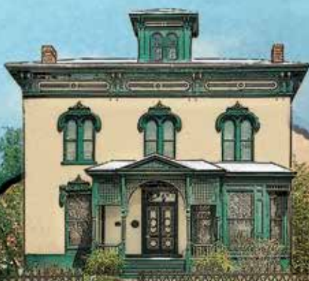
John Wells Pratt House