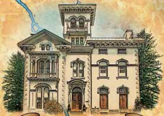
Richardson-Bates House Museum