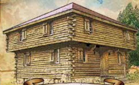
Fort Brewerton - Oliver Stevens Blockhouse Museum Brewerton