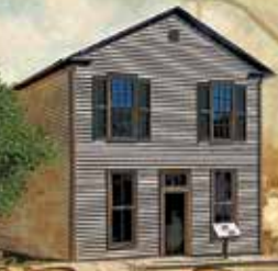
Starr Clark Tin Shop Mexico