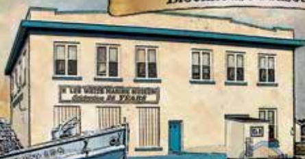
H Lee White Marine Museum