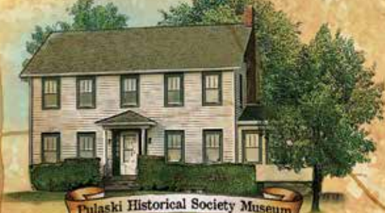
Pulaski Historical Society Museum Pulaski