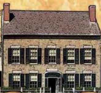
Fort Ontario State Historic Site