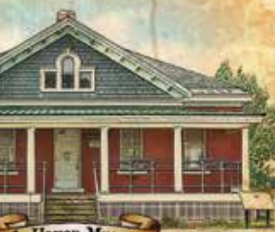
Safe Haven Museum Oswego