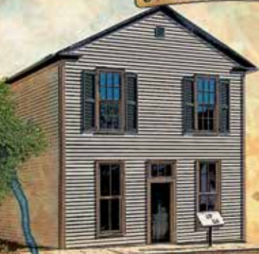
Starr Clark Tin Shop